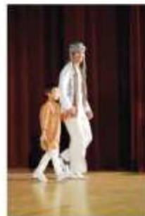
Racial Harmony is both embraced by our teachers and pupils in our Racial Harmony fashion parade show

The excitement did not end there. On 21st July, to commemorate Racial Harmony Day, pupils and teachers took part in a fashion parade on stage in their traditional costumes. There was a burst of colours during recess when mini stalls were set up and traditional food like satay and ketupat, muruku and peanuts were sold at the canteen. Pupils had an enjoyable time playing traditional games like five stones, kuti-kuti and chapteh. A bevy of graceful Punjabi dancers entertained the crowds with their upbeat moves and music.