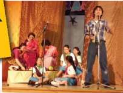
Four Friends and a Baby - a skit by Act 3