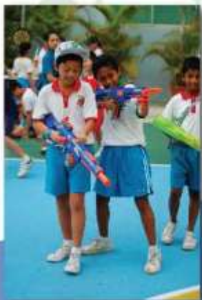
Training them young to enter the army