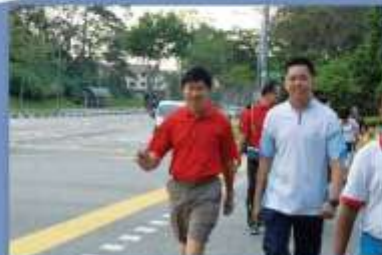
VP and SAC chairman, participating in the event

The Guest-of-Honour who graced the occasion was Dr Janil Puthuchery MP for Pasir Ris – Punggol GRC. With the blast of a horn, he signalled the start of the 3 Km Walk-a-Jog round the vicinity of the school at about 8.15 am. This was followed by the popping of colourful streamers and the cutting of exquisitely arranged cupcakes, heightening the joyful atmosphere of the occasion.