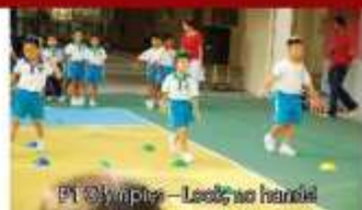
P1 Olympics - Look, no hands!

As for the Primary Five and Primary Six pupils, they took part in a doodling competition. Besides showcasing their artistic talents, the Primary Five pupils shared their creative perspectives on what the Singapore Spirit means to them while the Primary Six pupils were able to express their sense of nationhood and identity.