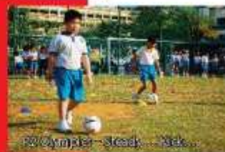
P2 Olympics - Steady... Kick...

As for the Primary Five and Primary Six pupils, they took part in a doodling competition. Besides showcasing their artistic talents, the Primary Five pupils shared their creative perspectives on what the Singapore Spirit means to them while the Primary Six pupils were able to express their sense of nationhood and identity.