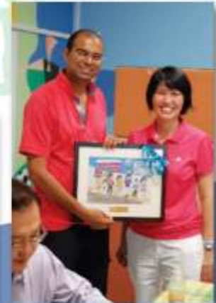
Token of appreciation to the Guest-of-Honour