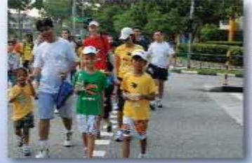
Even the kids are doing their part!

I want to take this opportunity to thank every member of the school fraternity, be it staff or pupils, as well as the PSG, as they had generously given their time, sweat and money to help the school raise funds. Overall, I feel the Walk-a-Jog cum Family Day was a resounding success as it brought our staff, pupils and their families together for a day of fun and excitement. I am glad to see that the efforts of our P4 and P5 pupils paid off for the Children's Market activity.