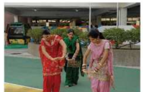
Graceful Punjabi dancers