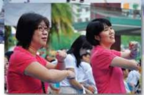
Exercise brings about fitness!

Almost 800 people gathered at Park View Primary School on the morning of 23 July 2011 for a Walk-a-Jog cum Family Day. Park View celebrates its 15th Anniversary this year. To kick start the celebration, the Walk-a-Jog cum Family Day was held. The school leveraged on the Walk-a-Jog to raise funds for several specific purposes. The funds raised would go towards canteen improvements, increasing self-study spaces, an installation of a turnstile gate at the back gate and in purchasing stepping stools for the lower primary pupils.