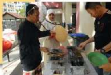
The satay man in action