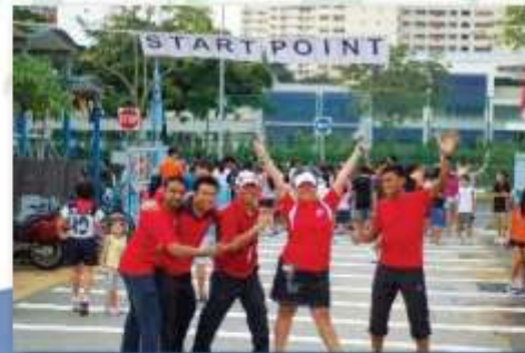
Getting the moods high before the race