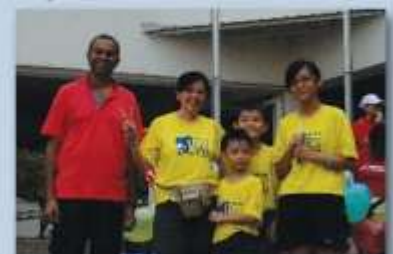
Most creatively dressed family