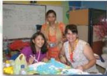
Busy writing wristbands