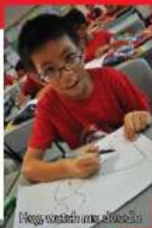
Hey, watch me draw!