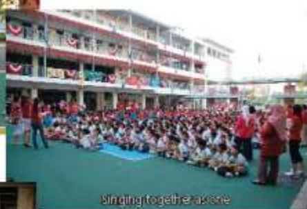
Binding together as one