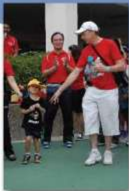
Most creatively dressed individual

The Guest-of-Honour who graced the occasion was Dr Janil Puthuchery MP for Pasir Ris – Punggol GRC. With the blast of a horn, he signalled the start of the 3 Km Walk-a-Jog round the vicinity of the school at about 8.15 am. This was followed by the popping of colourful streamers and the cutting of exquisitely arranged cupcakes, heightening the joyful atmosphere of the occasion.