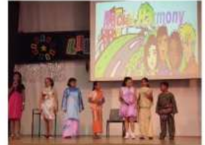
Askit by our very own pupils

A double celebration made it doubly fun when Park View celebrated the Library Fiesta and Racial Harmony Day together.