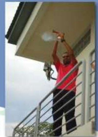
Sounding the horn

Participants also had a chance to patronise the stalls set up by the P4 and P5 pupils as well as parent volunteers. Through the donations from the Walk-a-Jog cards, the children's market and the PSG flea market, a sum of about $30,000 was raised.