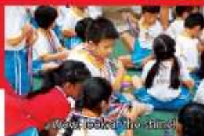
Wow, looker the friend!

At the end of the celebration, everyone went home early.