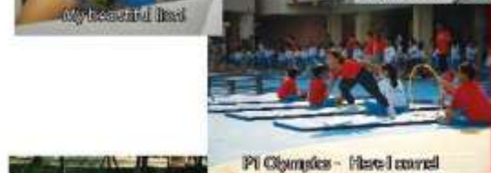
P1 Olympics - Here I come!

The Primary One and Two pupils had their Mini Olympics where they participated in telematches and played different games at the different stations. They played hard and overcame the challenges of each station. In the end, Lion House emerged as the champion for P1 while Falcon House was the champion for P2 for the Mini Olympics. The overall champion for the two levels was Falcon House. Every pupil was a winner and they went home proudly with a medal.