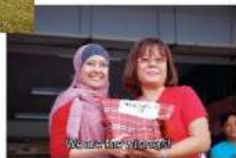
We are the winners!