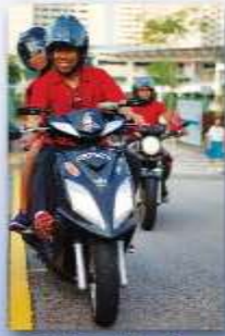
Enjoying the ride

The Walk-a-Jog was a great success. It was a very meaningful way of celebrating Park View's 15th Anniversary. The event brought the whole community together to participate in a wide range of activities, from fun physical exercises to the demonstration of enterprising skills by our pupils. The love and commitment for the school and the teamwork among our pupils, teachers and parents made me feel very proud to be part of the school's history.