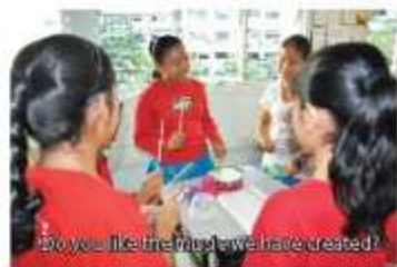
Do you like the map we have created?