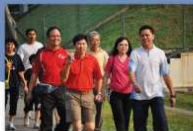
Enjoying the walk