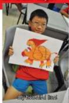
My beautiful lion