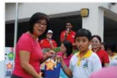
One lucky winner

The radiant morning sky that day had indeed, so aptly, reflected the cheery mood of the occasion and the camaraderie among its various participants.