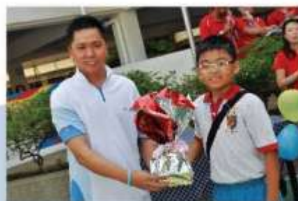
First prize winner