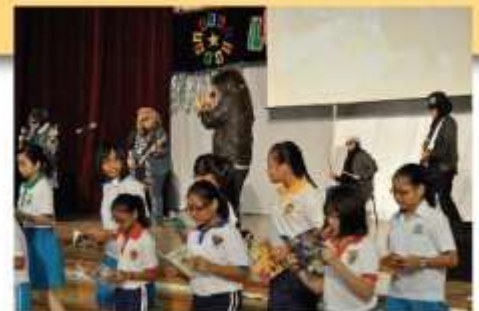
A rock band supporting our Library Fiesta's message, "Gotta Keep Reading"

The fiesta ended with a bang! A rock band accompanied the pupils in the finale with the message "Gotta Keep Reading". We did it again, Park View!