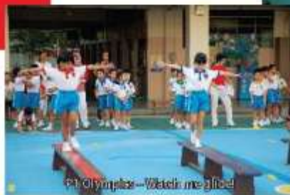
P1 Olympics - Watch me play!