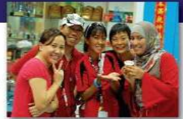
Multiculturalism at its best

What a proud moment it was to be a part of the school's 15th anniversary celebrations! It was encouraging to see so many pupils and their family members taking part in the Walk-a-Jog and also showing support for our children's market. A joyous moment that saw everyone synergize towards success! Onward Park View!