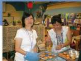
Cupcakes are ready