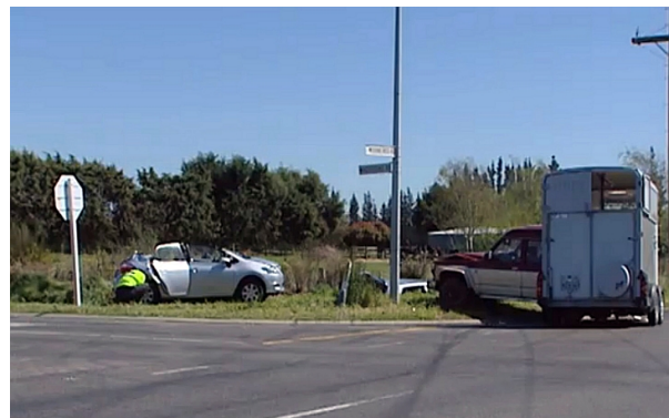
The scene of the accident

The Canterbury Police's Serious Crash Unit went to the scene to investigate the cause of the crash.