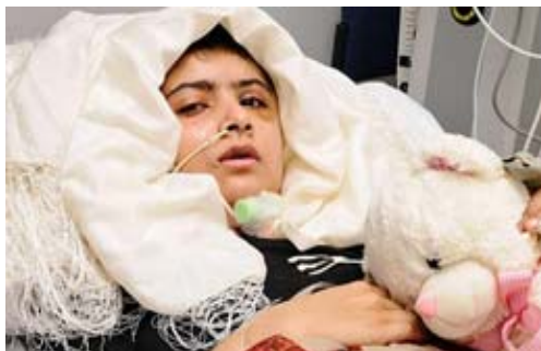
Malala Yousafzai in hospital after Taliban attack.

The journey for Malala has not been an easy one. Malala was seriously injured when a gunman shot her while she was riding home on a school bus.