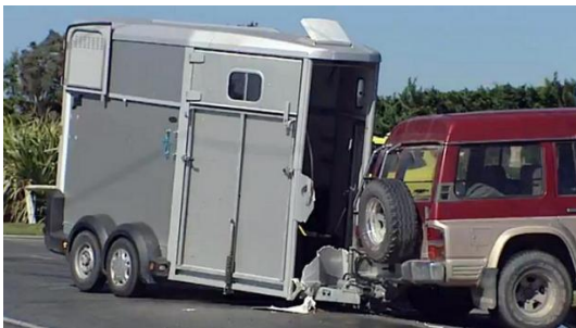
The four-wheel-drive and horse float

The SIA crew members' car, a rented Toyota, was travelling westward when it crashed into a four-wheel drive towing a horse float at a cross junction. A horse float is a trailer used for transporting horses.